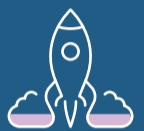
Startup Pitch Challenge