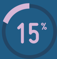
University / Research Center